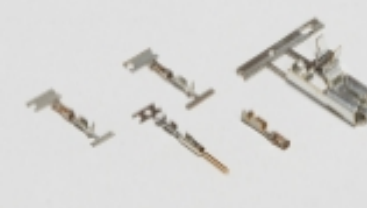
Wire-to-Board Connector Contacts(32)