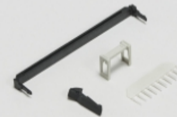
Ribbon Connector Accessories(1)