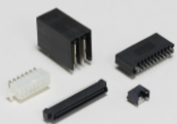
Standard Rectangular Connectors(2)