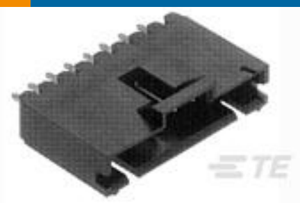
TE Part # 1977162-3 15 MTE HDR SRRA SMT.100CL w/o H-Downs