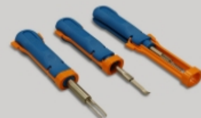
Insertion & Extraction Tools(2)