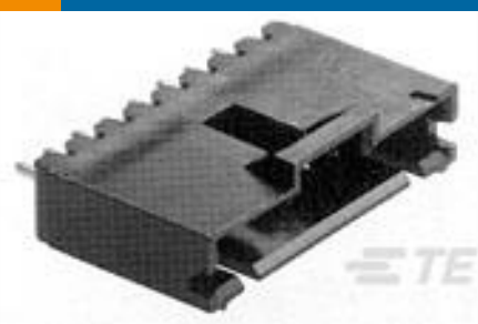
TE Part # 6-104915-4 15 MTE HDR SRST LATCH W/HLDWN