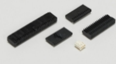
Wire-to-Board Connector Assemblies & Housings(585)