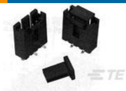
TE Part # 1825574-5 15 MTE VERT SMT HDR, w/o caps or bdlcks