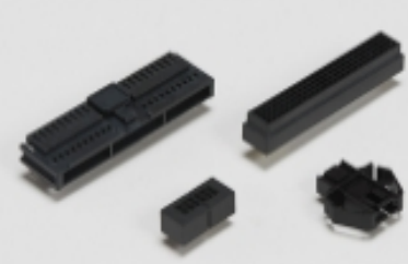
PCB Connector Shrouds(40)